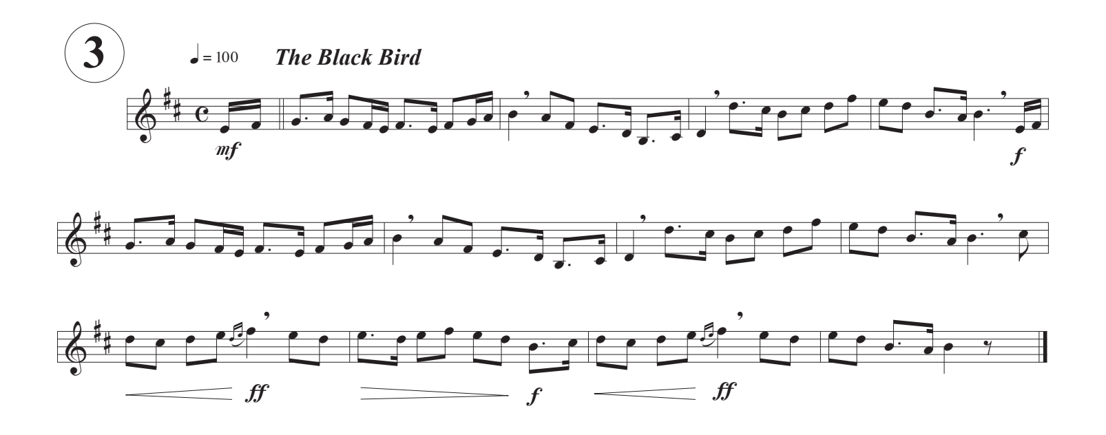
Please record the first and second parts as separate tracks